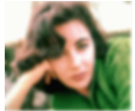
Fig. 2: What did she look like before diffusion?

Is the backward heat equation then just a mathematical curiosity? Certainly not. This ill-posed equation arises so naturally in problems of image enhancement, or more generally of undoing the effects of diffusion— deconvolution , in the language of signal processing—that it must have scientific meaning if only we tread carefully enough. In fact, there is a thriving field of the study of ill-posed differential and integral equations, and a key technique in this field, going back to Tikhonov, is regularisation . If a problem is ill-posed, the idea is to attach certain extra conditions that exclude pathological solutions and render it well-posed. Typically a regularisation parameter is involved—an adjustable notion of “pathological”—and throughout medicine and engineering, in applications as important as ultrasound, MRI, CAT, and PET imaging, these ideas are well developed.