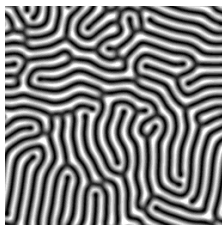
Fig. 1b. k = 0.65, F = 0.6

Figure 1a illustrates a typical pattern generated by (1) for one choice of parameters. The snapshot shows values of u , with white corresponding to u = 1 . We see regular dots in a hexagonal array interrupted by occasional dislocations. In Figure 1b, with different parameters, the favoured structures are interlocking black and white channels. Both of these patterns move in time.